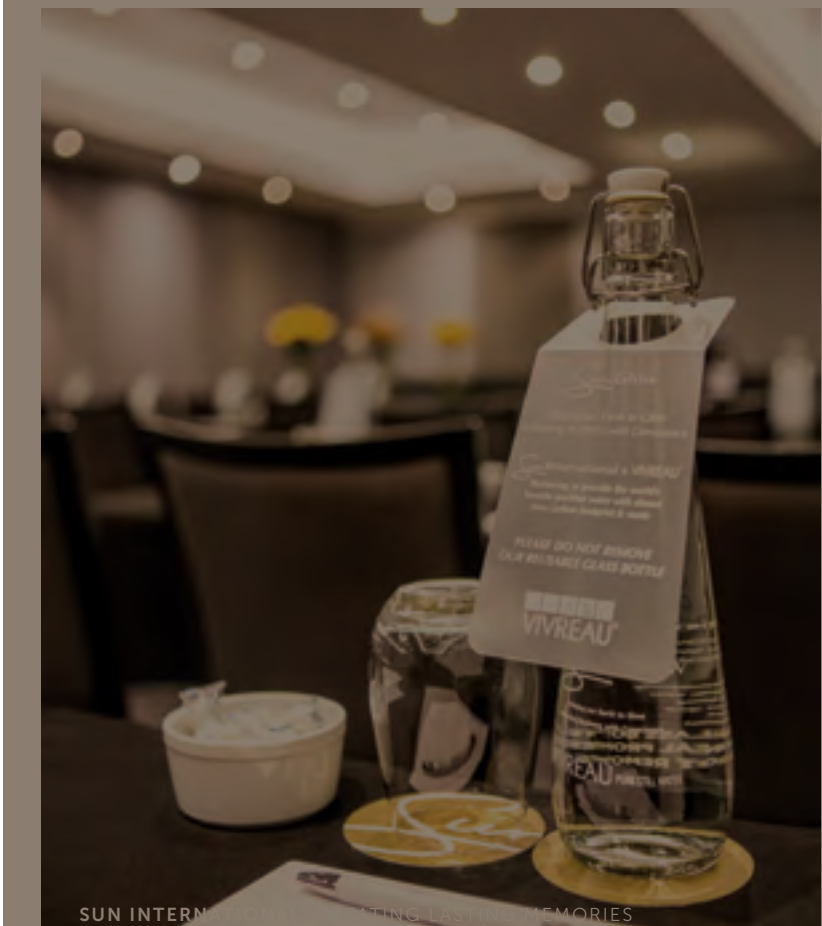
SUN INTERNATIONAL - CREATING LASTING MEMORIES