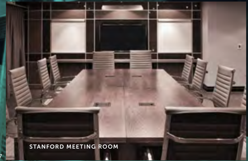
STANFORD MEETING ROOM

At The Maslow, every meeting room is designed to be a game-changer – a place that fosters success. Ranging from 24m 2 to 56m 2 , they are conducive to productive workshops, strategic thinking, effective team building and well-deserved relaxation. There is also a dedicated lunch and lounge area leading onto oasis gardens that offer alternative breakaway zones for meeting and dining opportunities.