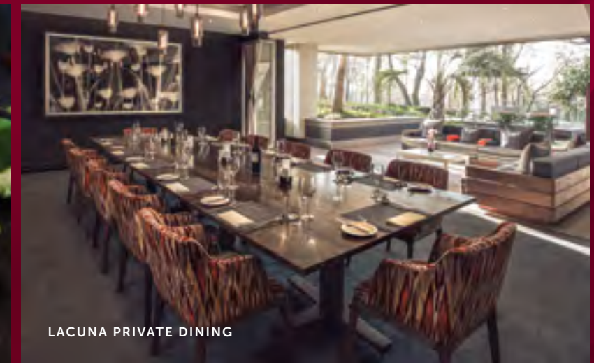
LACUNA PRIVATE DINING