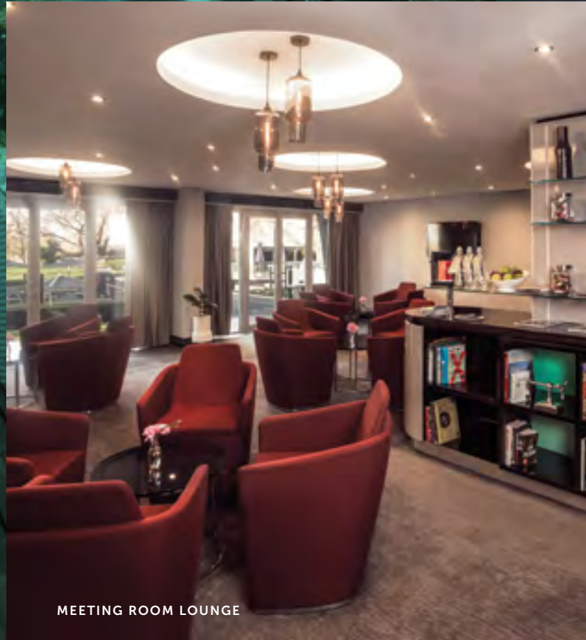
MEETING ROOM LOUNGE