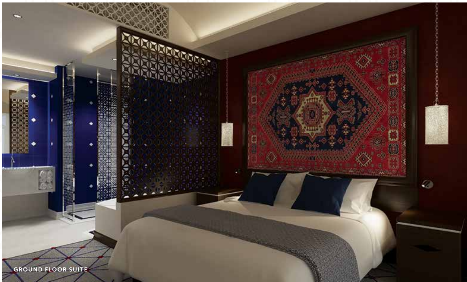
GROUND FLOOR SUITE