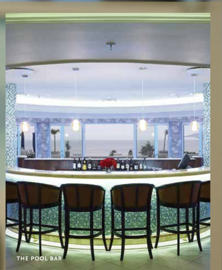
THE POOL BAR

Lounging next to the hotel outdoor pool offers guests the opportunity to escape the hustle and bustle of city life, savouring nature's finest whilst in one location. It's where one can soak up some sun, indulge in a delicious cocktail or doze off to the sound of crashing waves whilst deeply inhaling fresh ocean air.