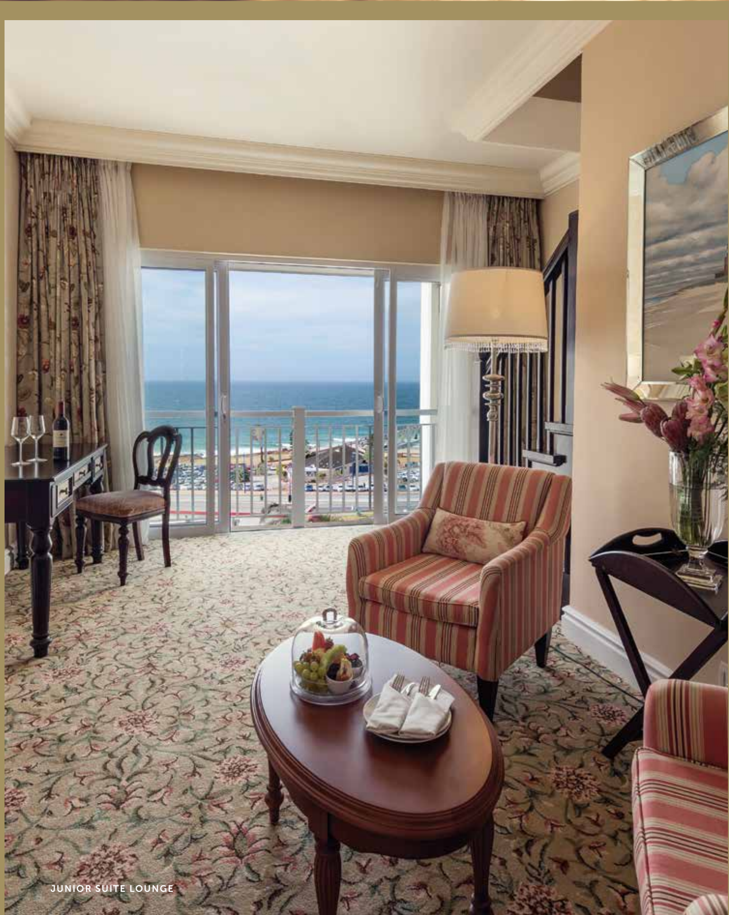
JUNIOR SUITE LOUNGE