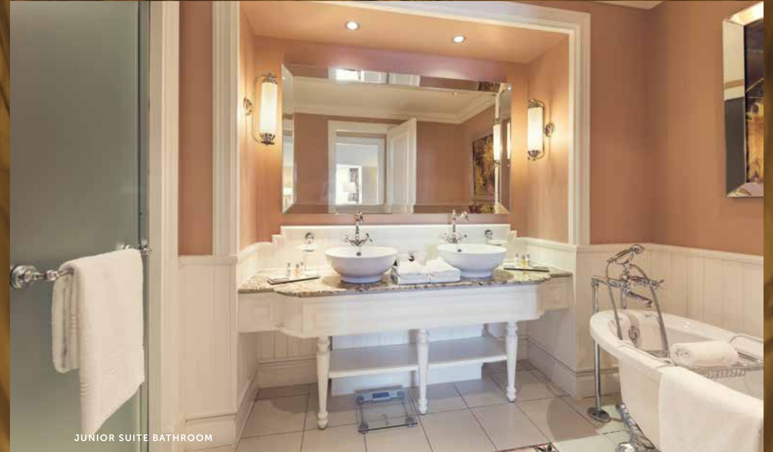
JUNIOR SUITE BATHROOM