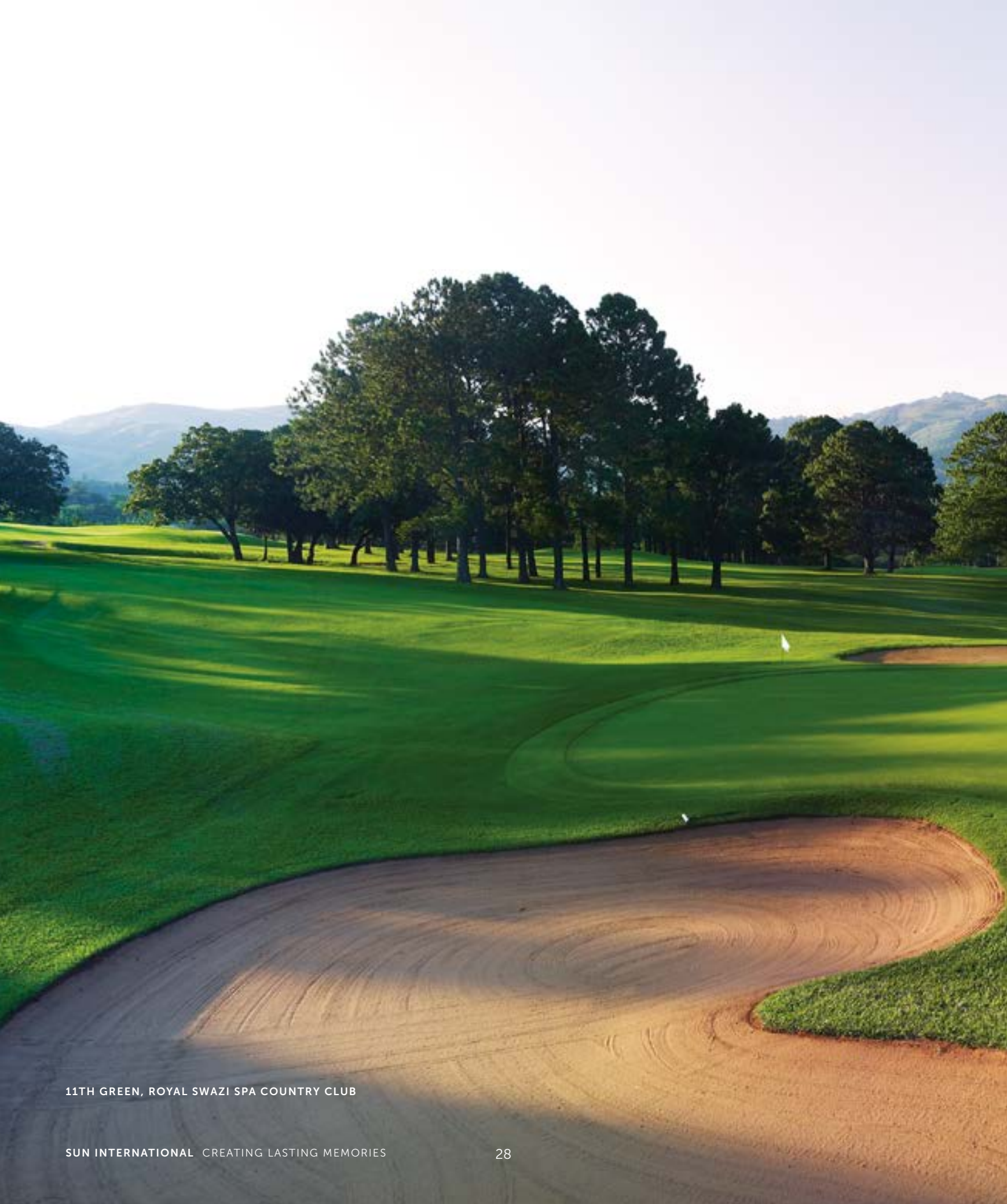
11TH GREEN, ROYAL SWAZI SPA COUNTRY CLUB