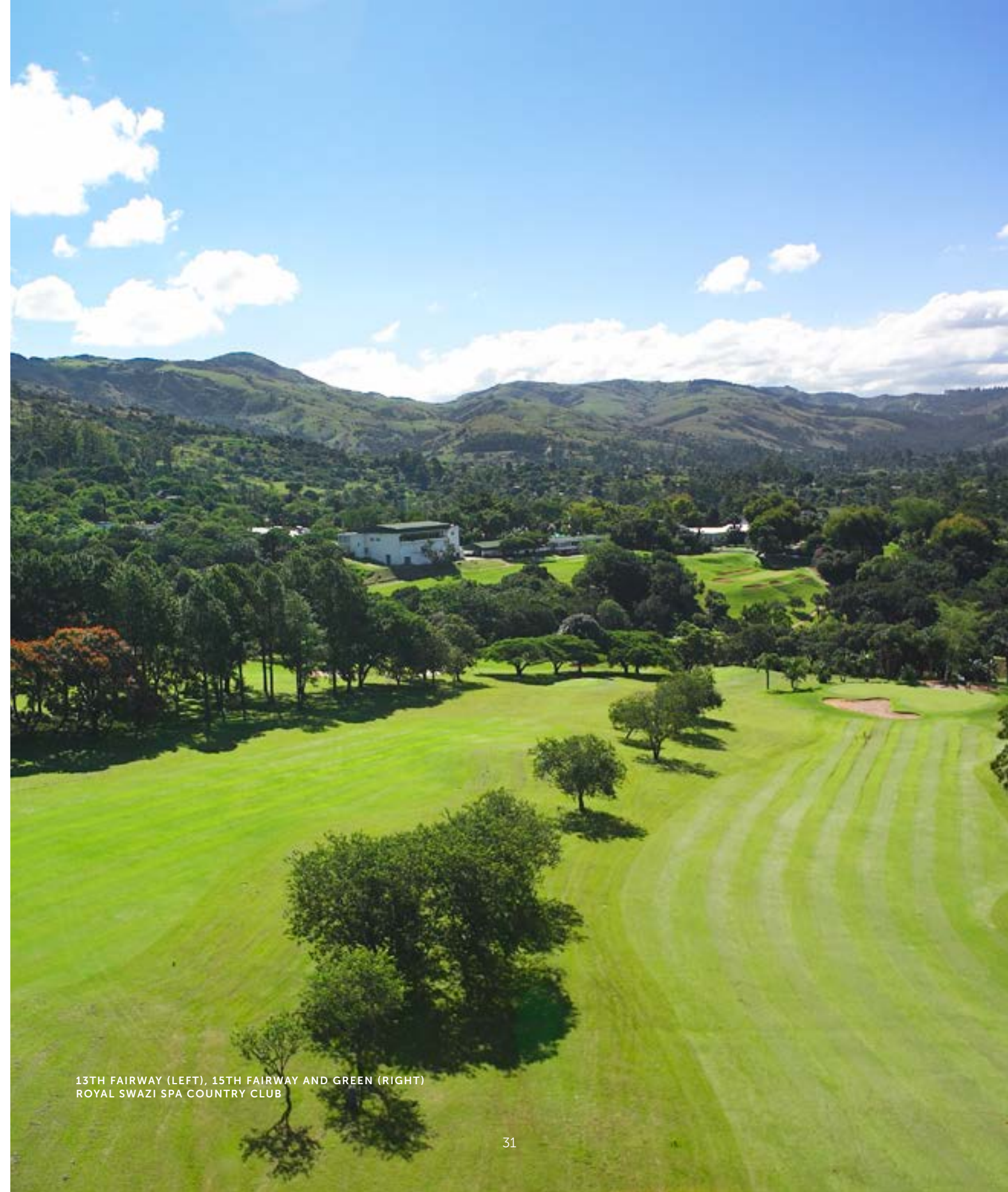
13TH FAIRWAY (LEFT), 15TH FAIRWAY AND GREEN (RIGHT) ROYAL SWAZI SPA COUNTRY CLUB

For more information, please contact our Events and Entertainment Department Tel +27 11 780 7673 Fax +27 11 780 7030