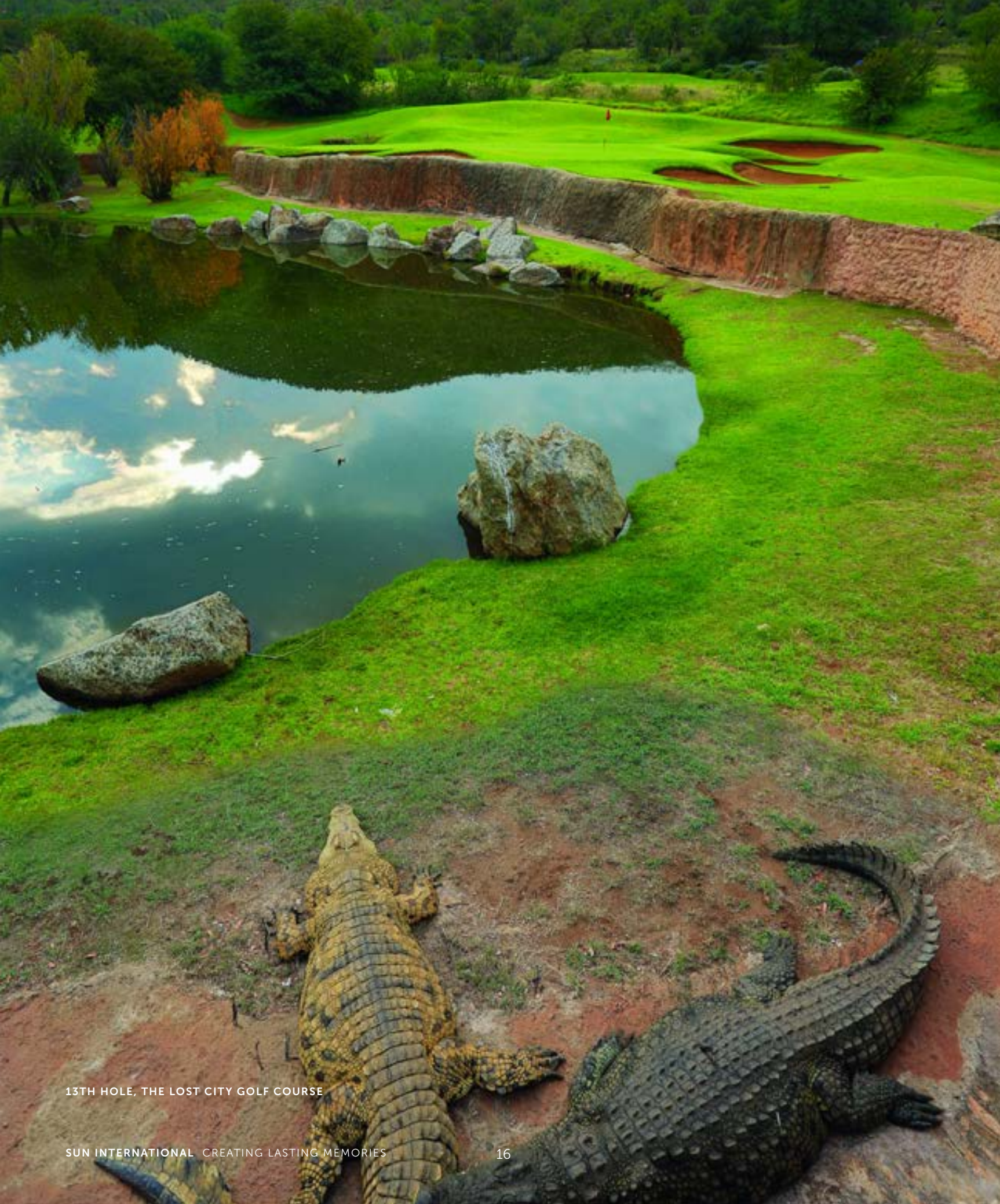
13TH HOLE, THE LOST CITY GOLF COURSE