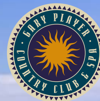
1ST HOLE, GARY PLAYER COUNTRY CLUB

When construction of the Sun City Resort began in 1978, the decision was taken to build a golf course that would rival the best in the world. From the championship tees, the course measures a mammoth 8000 yards – but either the intermediate or the forward tees can be used without the integrity of the design being impaired. Another strength of this layout is that it favours no particular shape of shot.