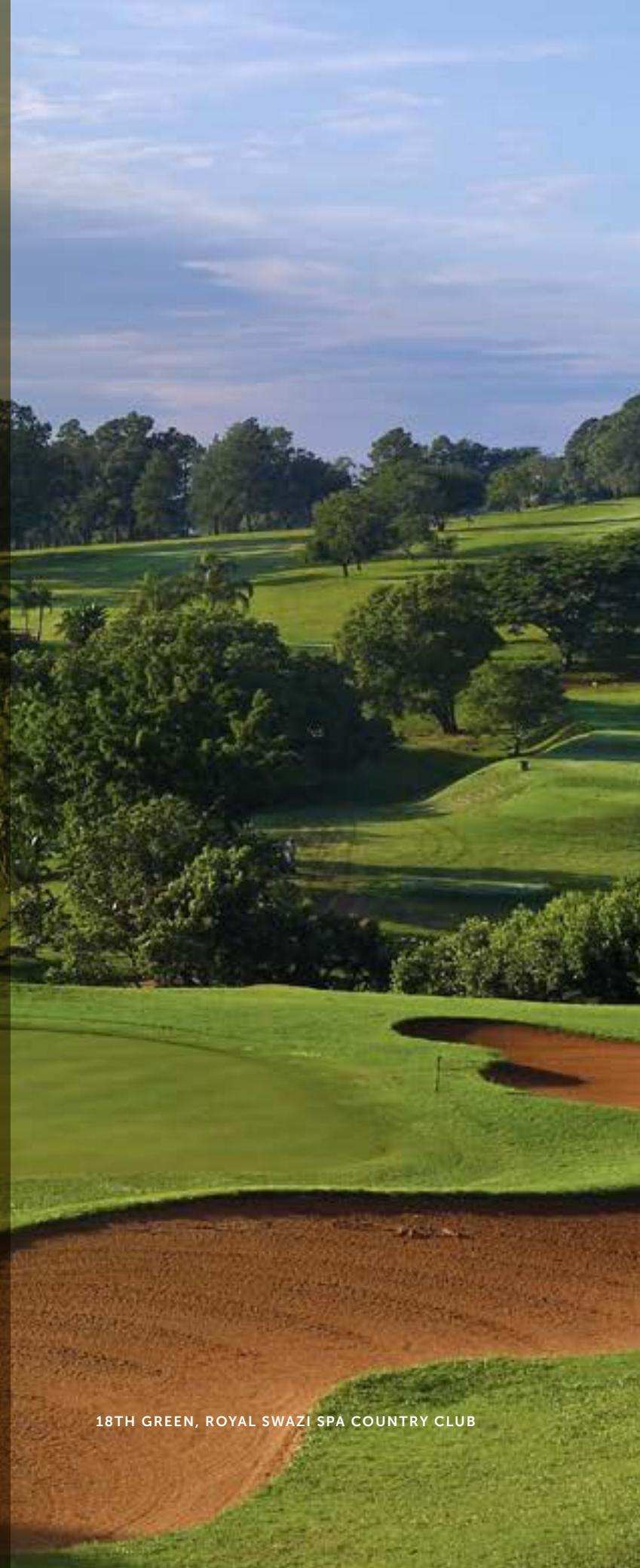
18TH GREEN, ROYAL SWAZI SPA COUNTRY CLUB

Many golfers have scored their lowest rounds on this quaint course, and most play to their handicaps quite comfortably. The romantic colonial architecture and wonderful gardens of Sun International's Royal Swazi Spa makes for a very luxurious setting, while Lugogo Sun has its own particular charm. Both hotels have superb food and services, couched in evocative African themes. Guests can take their choice from energetic pursuits of horse riding, mountain climbing and hiking, or relax around the wonderful swimming pool, play tennis, bowls or squash, or just rejuvenate at the premier spa.