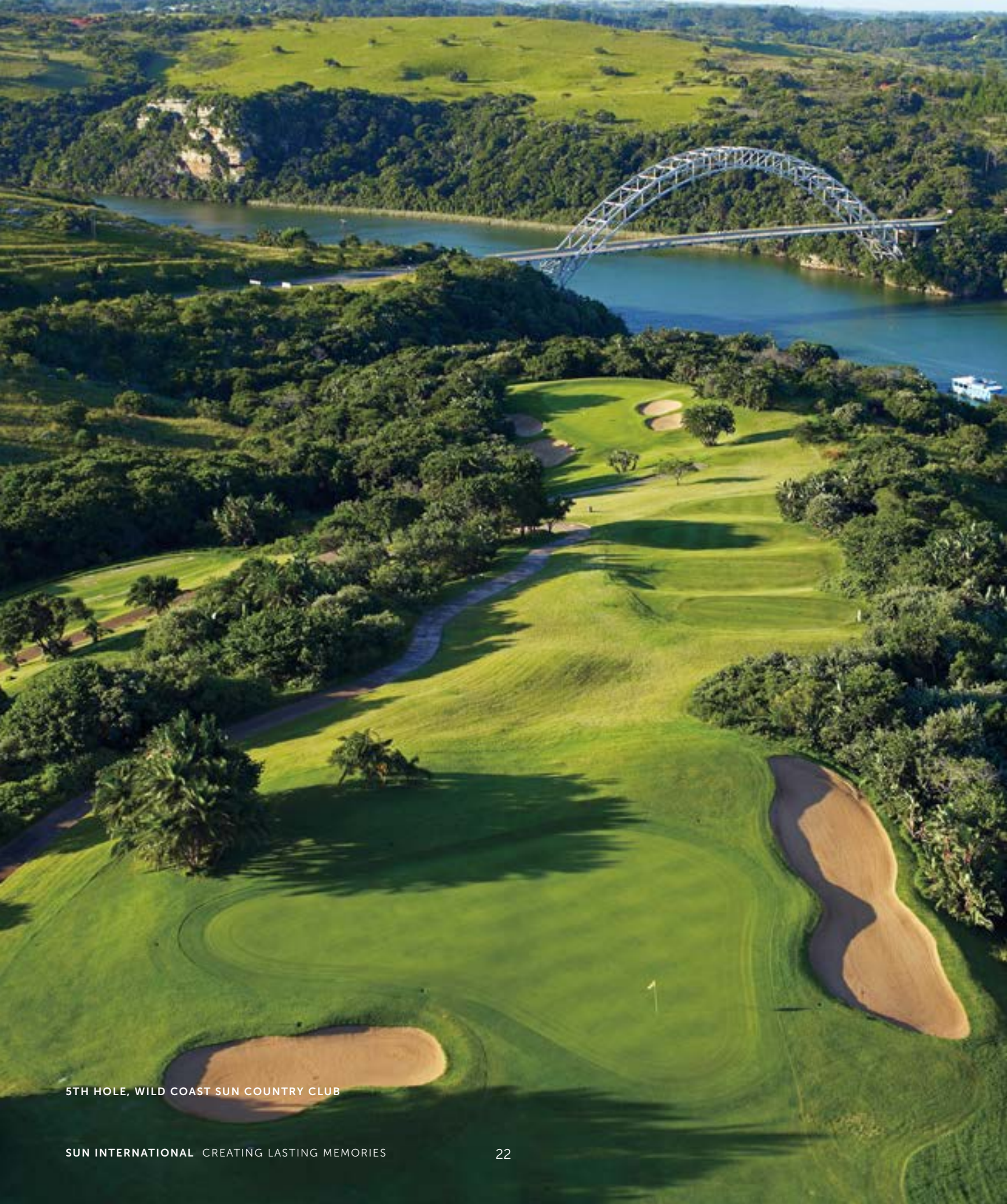
5TH HOLE, WILD COAST SUN COUNTRY CLUB