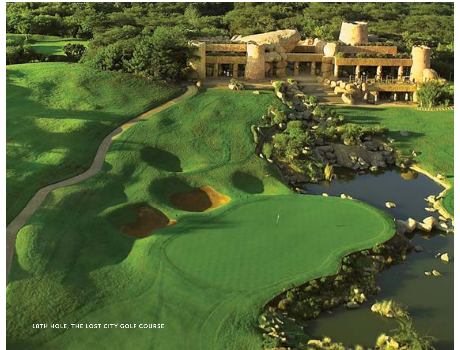
18TH HOLE, THE LOST CITY GOLF COURSE

Golf isn't all about bunkers, birdies and bogeys, in fact, in our world it is a game that includes African bushvelds, oceanic views, perfectly manicured Kikuyu fairways and mountainous terraces.