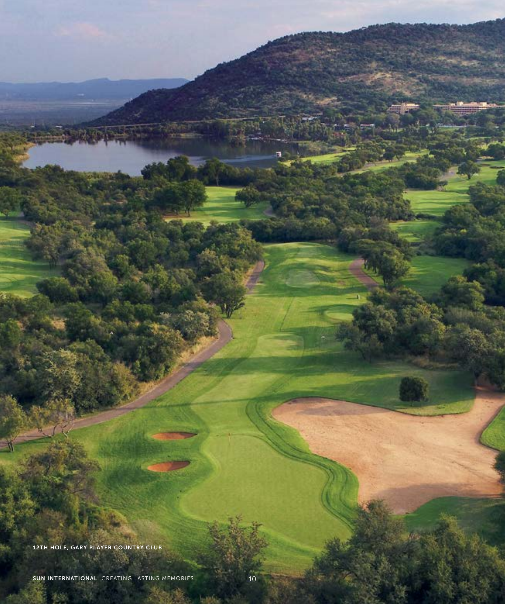
12TH HOLE, GARY PLAYER COUNTRY CLUB