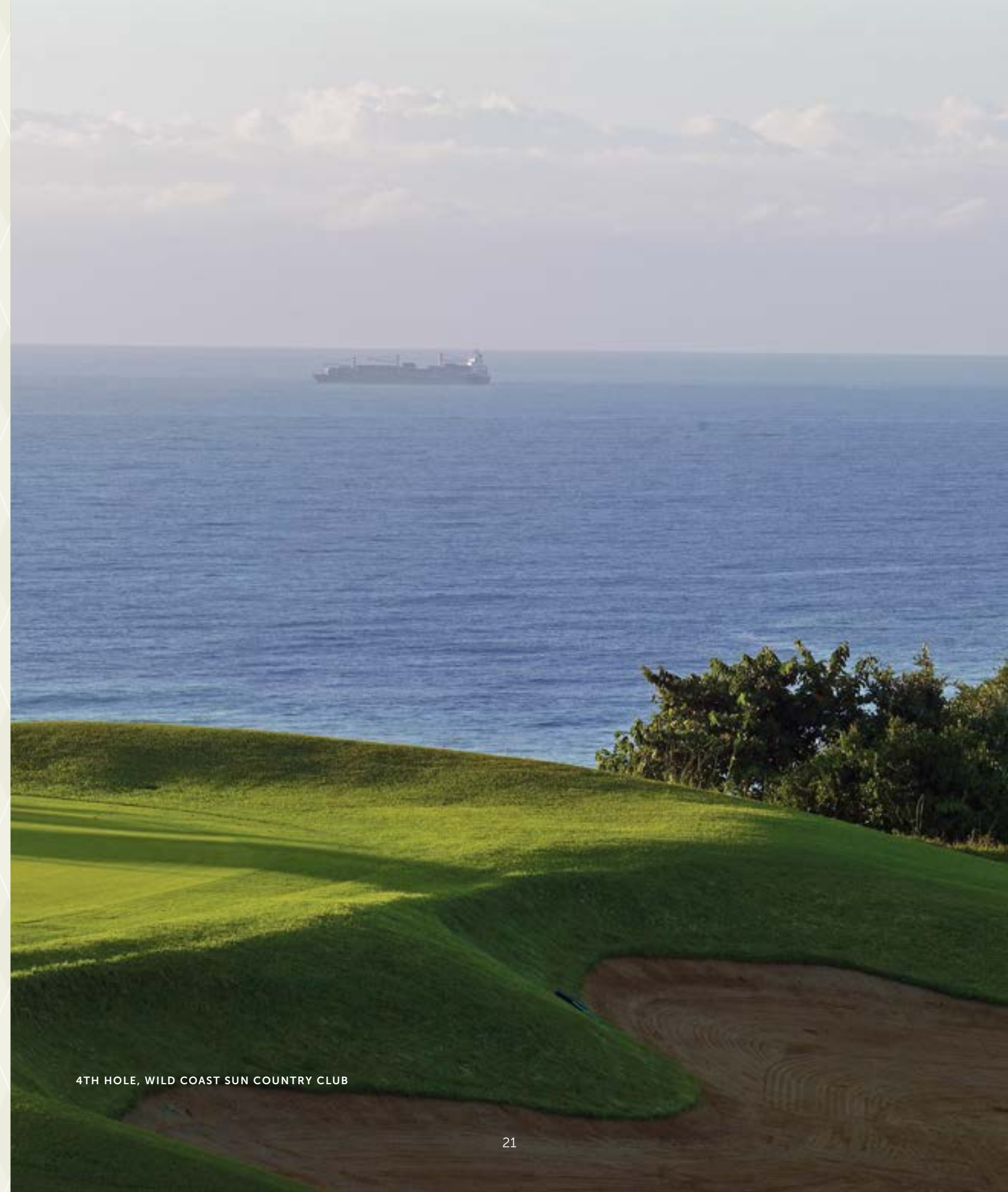
4TH HOLE, WILD COAST SUN COUNTRY CLUB

The Wild Coast Sun resort, on the South Coast, is just 90 minutes drive from Durban. The hotel is in a breathtaking setting, only metres from the Indian Ocean surf line. The resort is intimate and fun with gaming, horse riding, a world-class themed Wild Waves Water Park and of course golf on offer. Add to this the beach attractions and you have a destination for the whole family. Everything's there for comfort, from the beautiful finishes in the 396 guest rooms, to the Aloha Village for kids and the young at heart. Altogether, the Wild Coast Sun is a journey you should not miss out on.