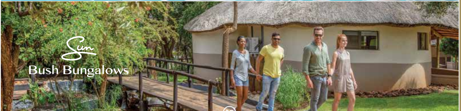
Sun Bush Bungalows