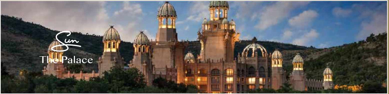
Sun The Palace