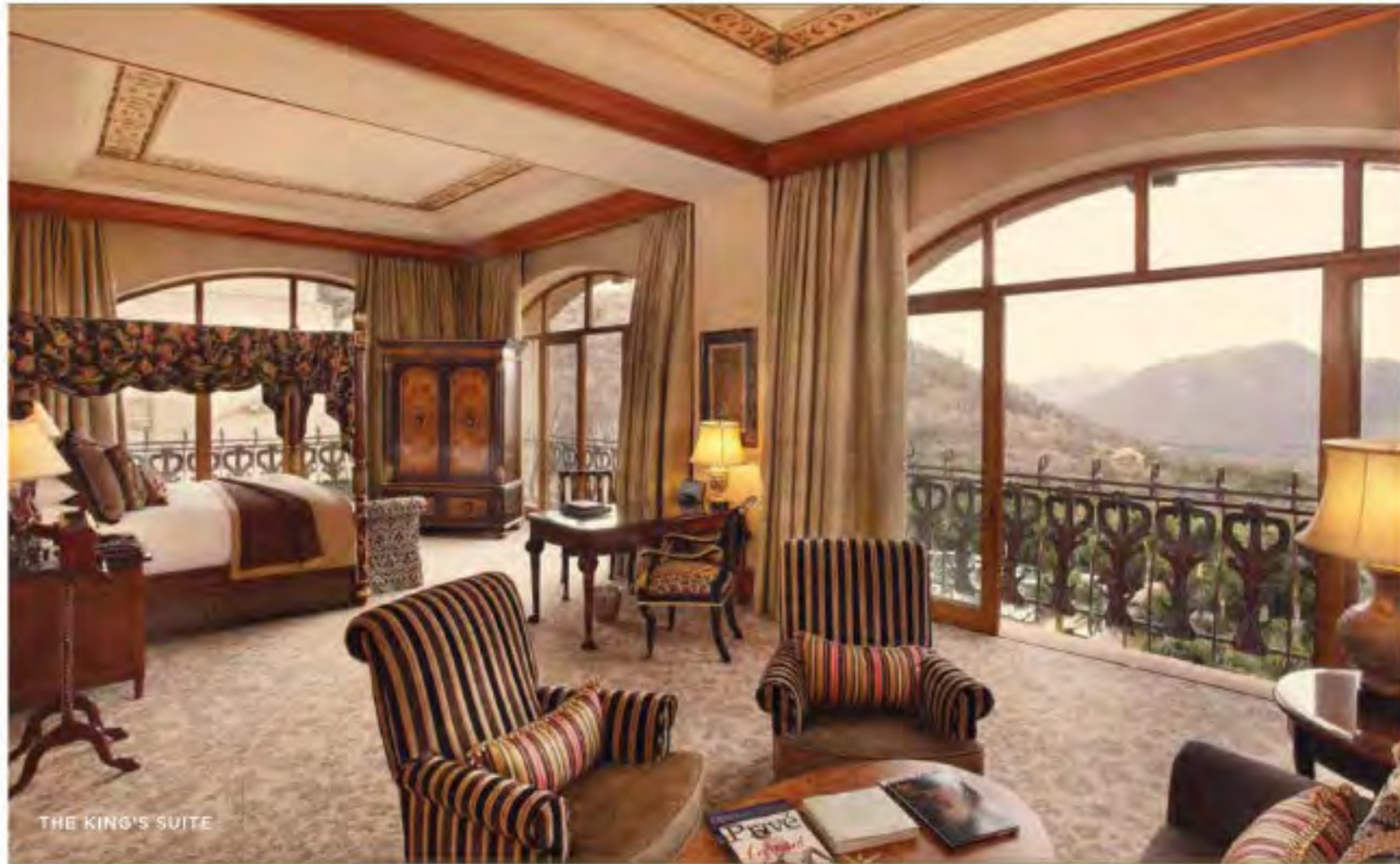
THE KING'S SUITE