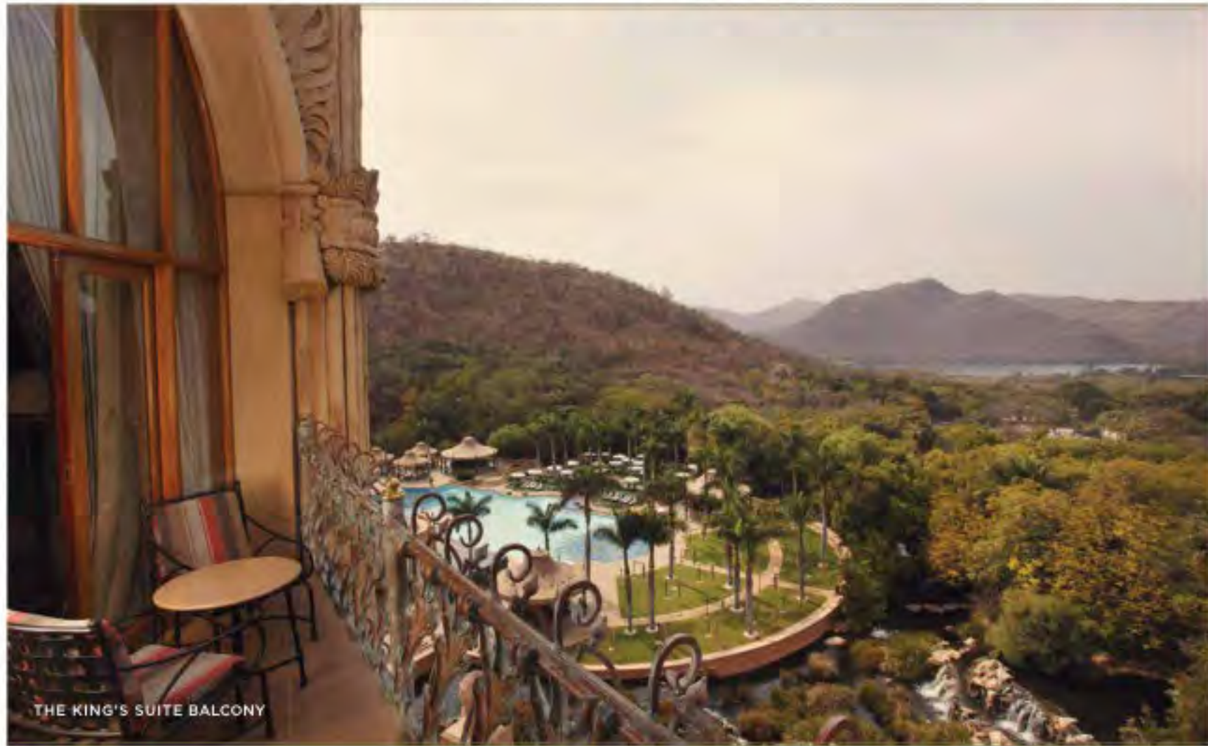
THE KING'S SUITE BALCONY